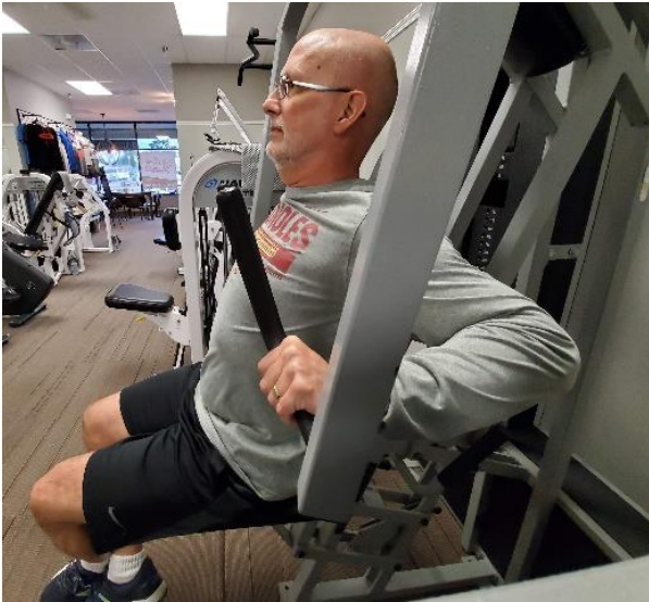
The Wrong Way-Shoulder Overstretched