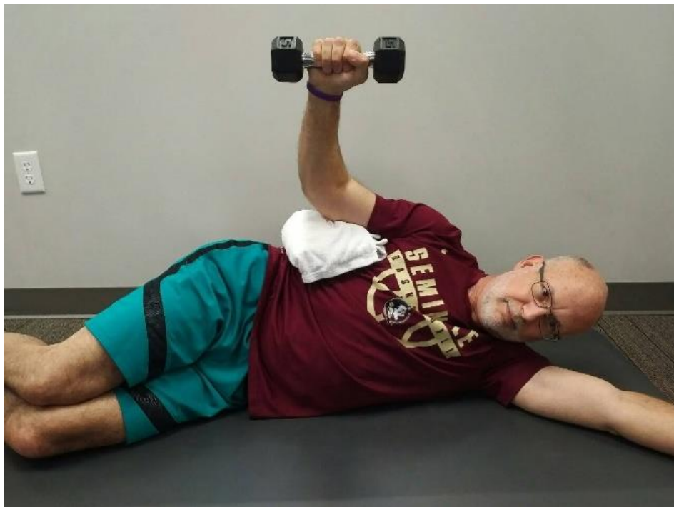
Rotator Cuff Strengthening

Common problem areas include the deep muscles of the shoulder, the lower back, the hands, the neck, and the knees. Taking the time to train these areas will pay huge dividends in keeping you at your highest possible level of pain-free function.