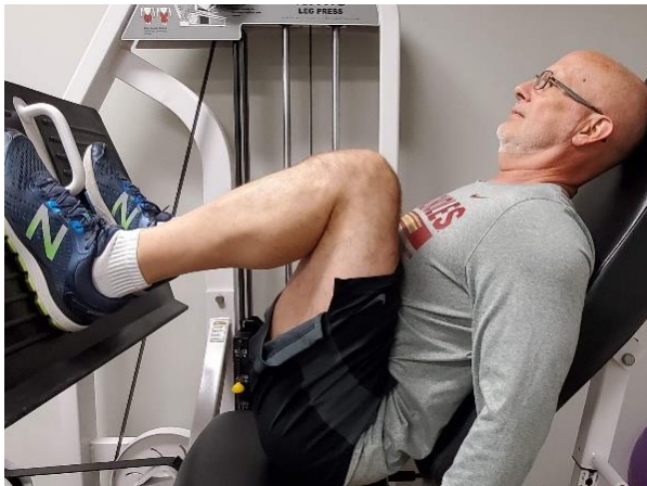
The Wrong Way-Knees Overstretched