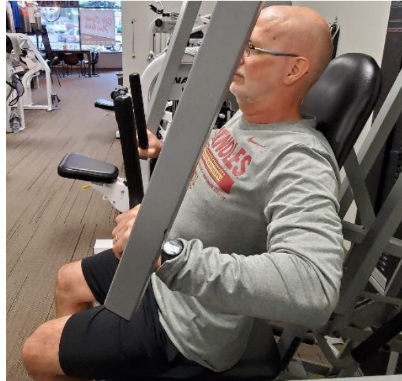
The New Way-Limited Stretch