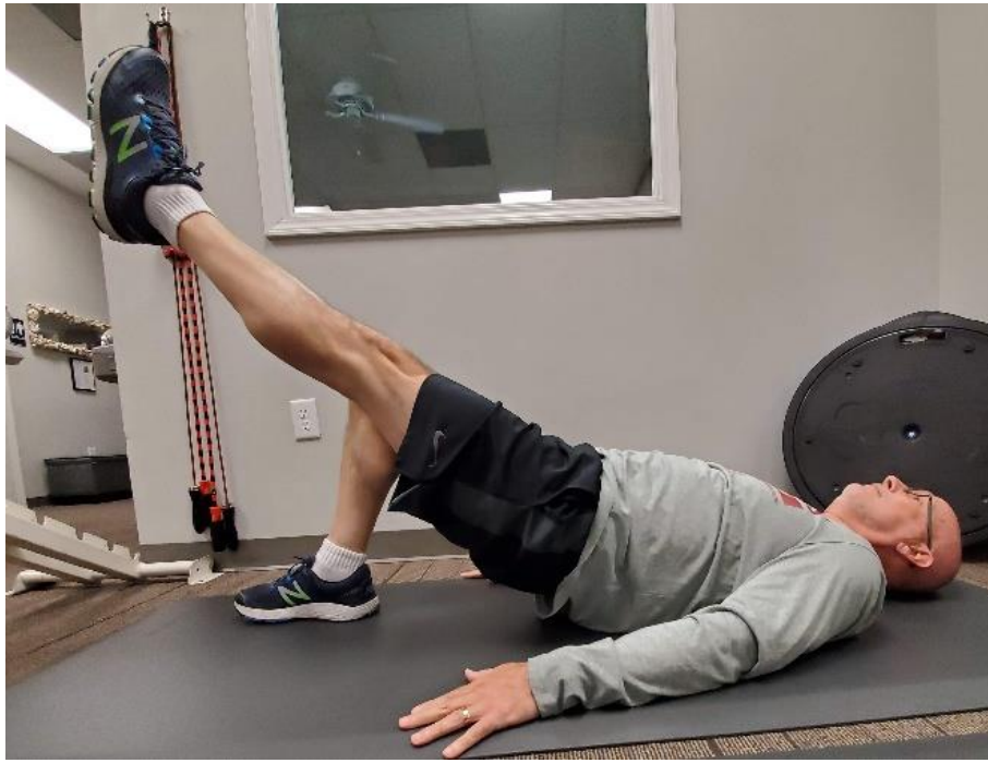
Lumbar Spine Stabilization

Click HERE for videos of these rebuilding exercises