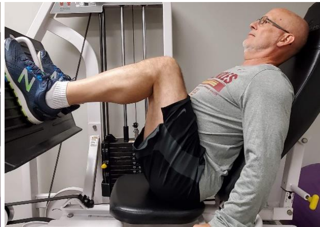
The New Way-Limited Stretch

So from now on, I want you to determine a comfortable stretch position for every exercise. If it's difficult or painful for you to get into a machine or reach the stretch position during the exercise, you're going too far. Strength training is supposed to help you, not hurt you.